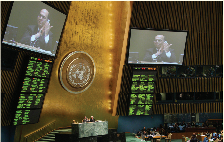
2 April 2013: General Assembly adopts the Arms Trade Treaty